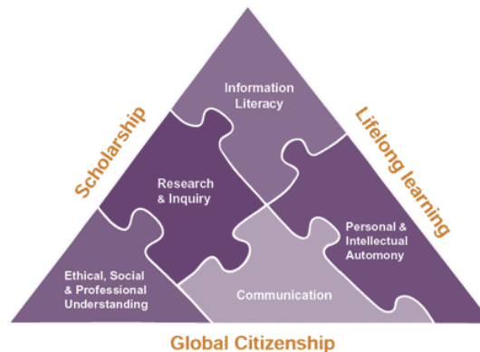
Figure 1 - Conceptualisation of Graduate Attributes at the University of Sydney